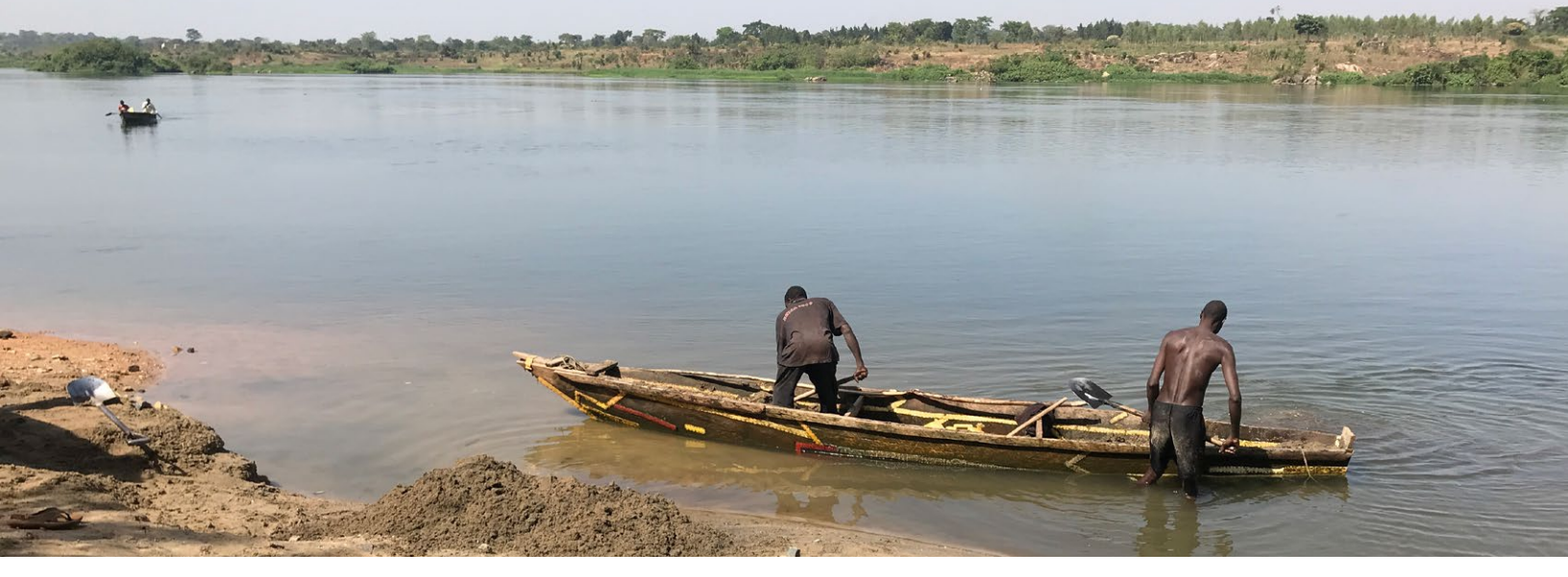
Local sand miners-Uganda (Bujagali)

In the Uganda: Water Management and Development Project and Energy for Rural Transformation Phase III Project ("Uganda Bujagali III"), the Requesters expressed concern about the impact of land take and failure to compensate PAPs fully in a timely manner.<sup>46</sup> This affected entire households, but greatly impacted children, "particularly [in] households whose income and food security depended on their gardens and attached fields."<sup>47</sup>