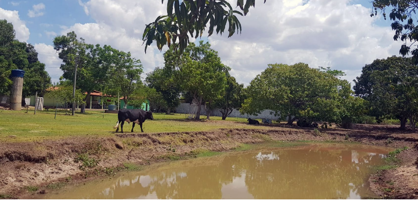
Community Members' Property-Teresina, Brazil

It is better if PAPs do not have to compete for training opportunities with other community members who are not adversely affected by the project.