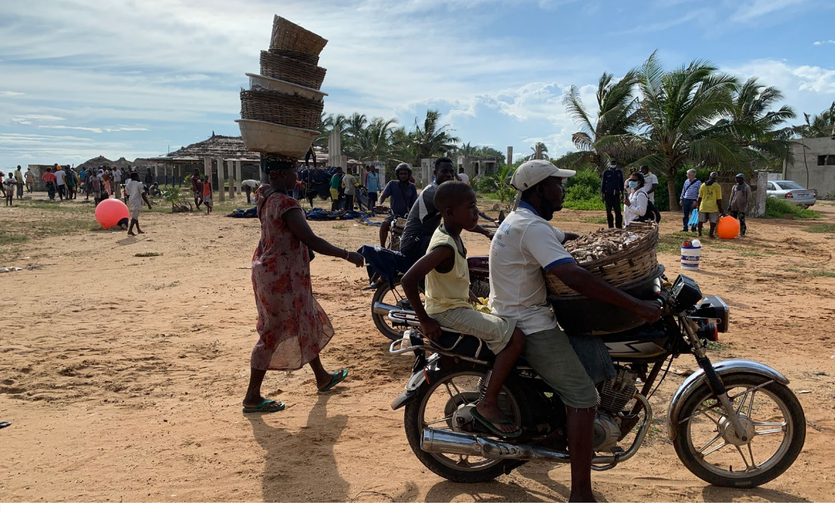
Fisher's Associated Value Chain-Togo (WACA)

(f) Scale and Severity of Impact. Some of the projects the Panel has reviewed spanned enormous geographical areas of land or water, which were the bases for the livelihoods of the surrounding communities. In the India: Amaravati Sustainable Infrastructure and Institutional Development Project ("India Amaravati") case,69 the Bank project included works on 10 priority roads and flood mitigation measures.70 The initial footprint-corresponding to 30 percent of Bank financing-directly affected 3,933 landowning households who had to give up their farmland for the development of Amaravati project.71 The Bank also recognized as PAPs 21,374 landless laborer households-which included landless tenants—as it was challenging to differentiate between landless laborers affected by land pooling within and outside the Bank project's boundaries.72 The Panel noted the Bank needed to ensure that provisions for the livelihoods of these 25,307 households-and others affected by future project investments-were in line with the World Bank's Policy on Involuntary Resettlement (OP/BP 4.12) and implemented accordingly.<sup>73</sup>