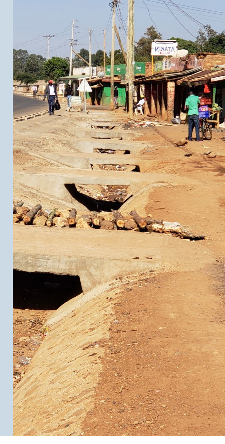
Mobile Traders at the Webuye Interchange-Kenya (Transport Sector Support Project)

Artisanal fisheries in West Africa are diverse and use different techniques and equipment (purse seine, beach seine, tonga, line fishing, etc.).<sup>60</sup> For each fishing technique, fishers perform specific tasks and play different roles.<sup>61</sup> In the WACA Togo investigation, the Panel learned that certain fishing techniques would have to cease temporarily, including fishing that involved the landing of boats or hauling of fish close to sites where groynes are being built.<sup>62</sup> In purse seine<sup>63</sup> fishing, pirogues moor