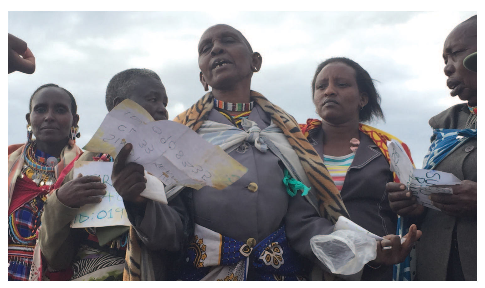
© World Bank/Inspection Panel. Further permission required for reuse.