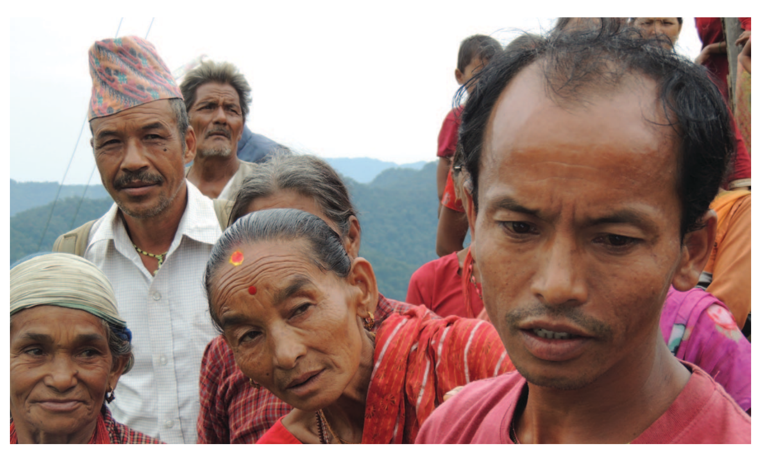
© World Bank/Inspection Panel. Further permission required for reuse.