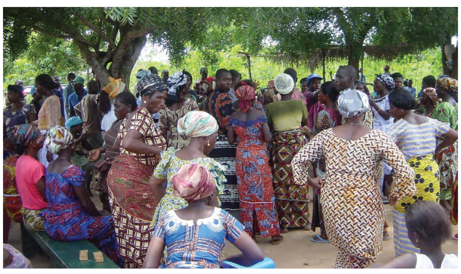
© World Bank/Inspection Panel. Further permission required for reuse.