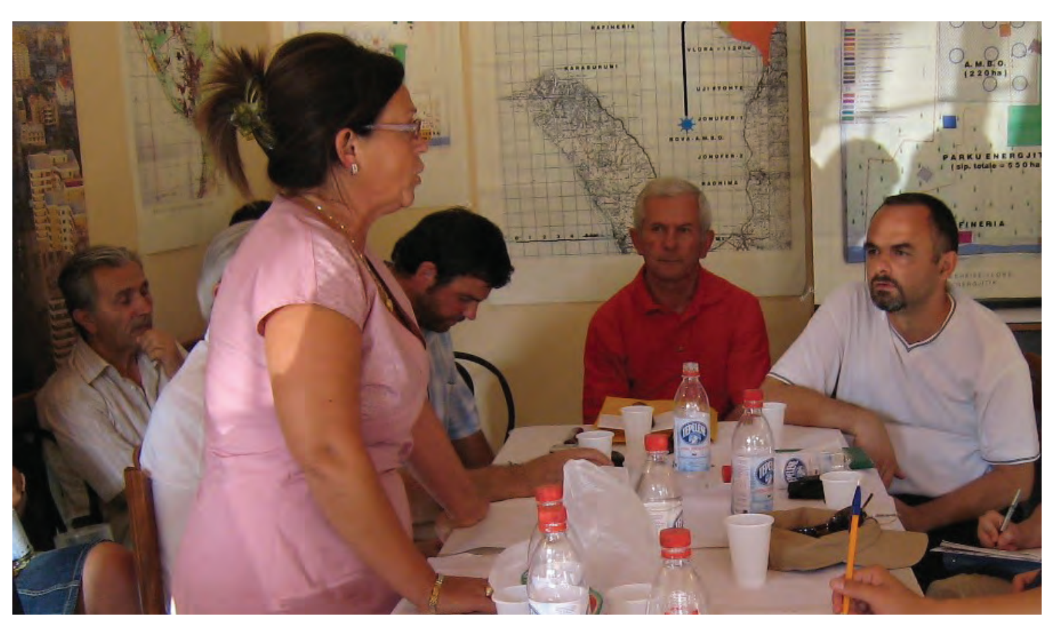
© World Bank/Inspection Panel. Further permission required for reuse