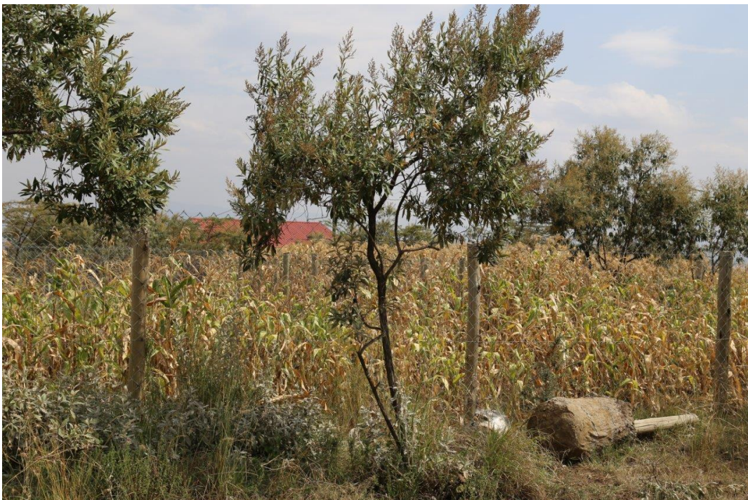
Picture 6. Subsistence maize farming at RAPLand