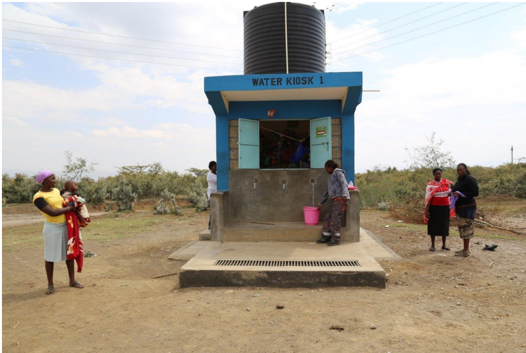
Picture 4. Water kiosk at RAPLand