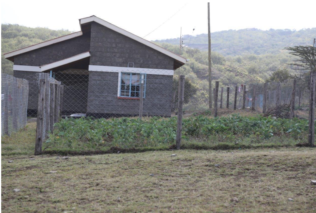
Picture 2. House at RAPLand