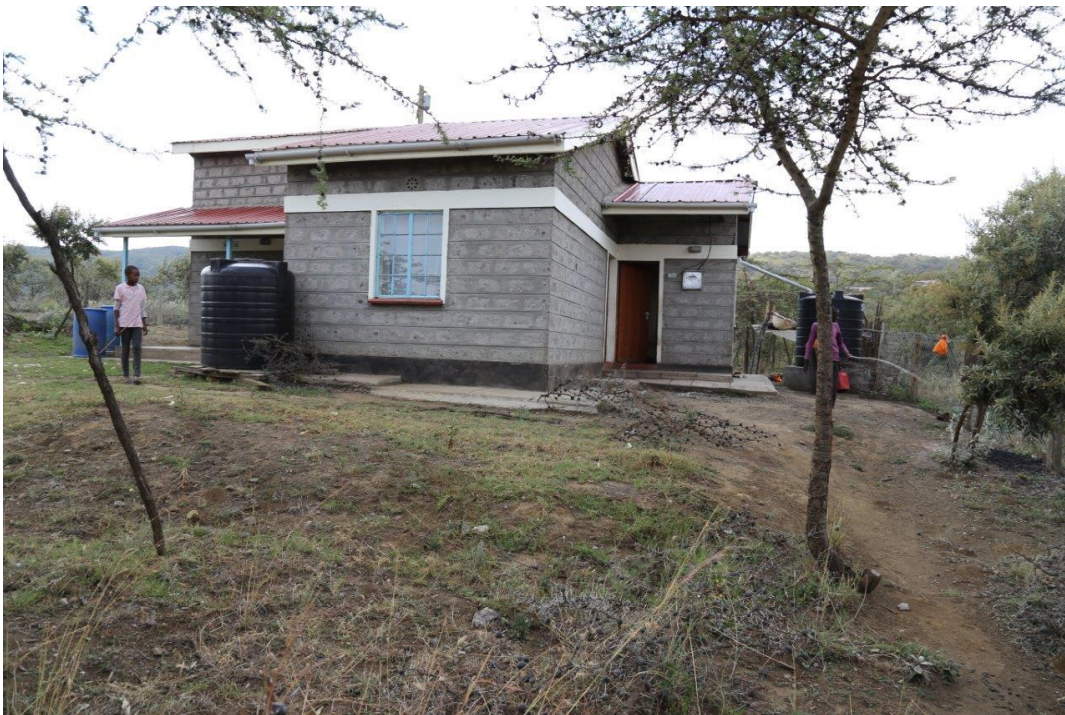
Picture 10. House at RAPLand