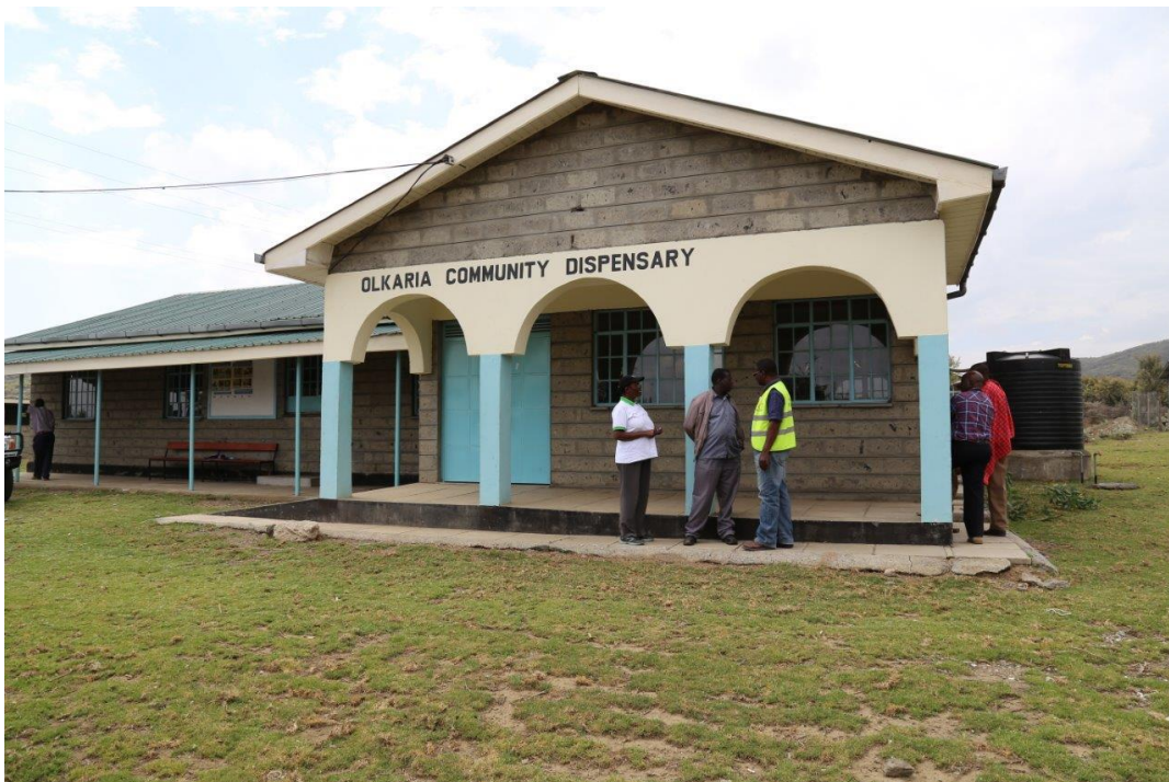
Picture 8. RAPLand Community Clinic