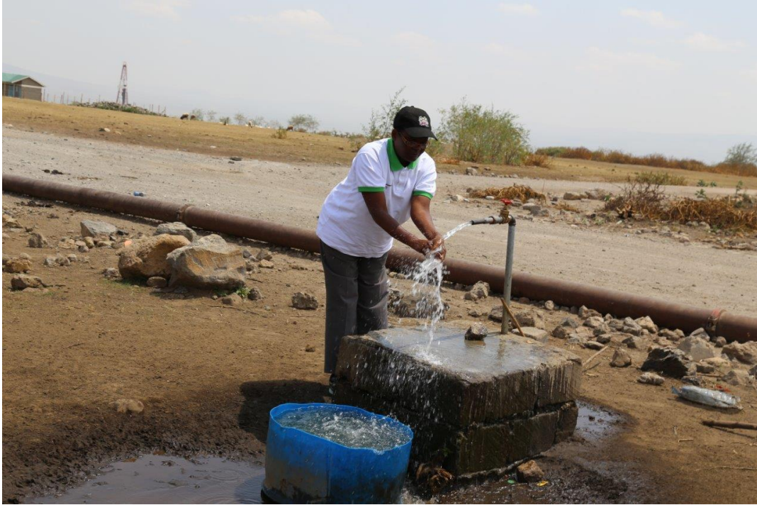
Picture 6. Communal stand pipe at RAPLand