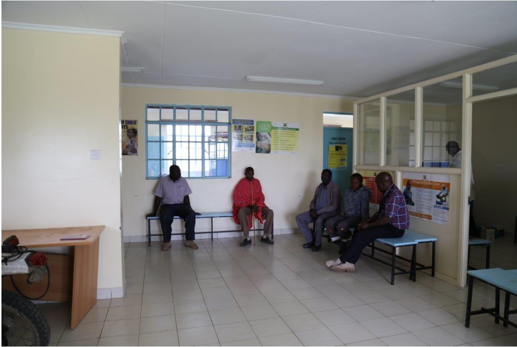
Picture 9. RAPLand Community Clinic waiting room