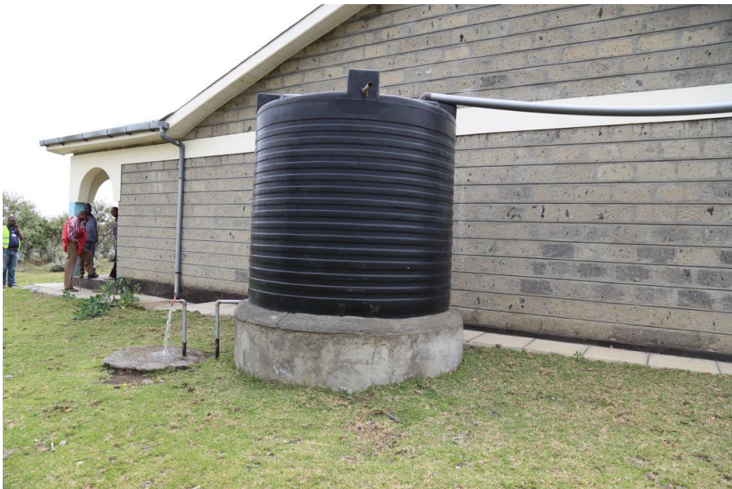
Picture 5. Water tank at the RAPLand Community Clinic