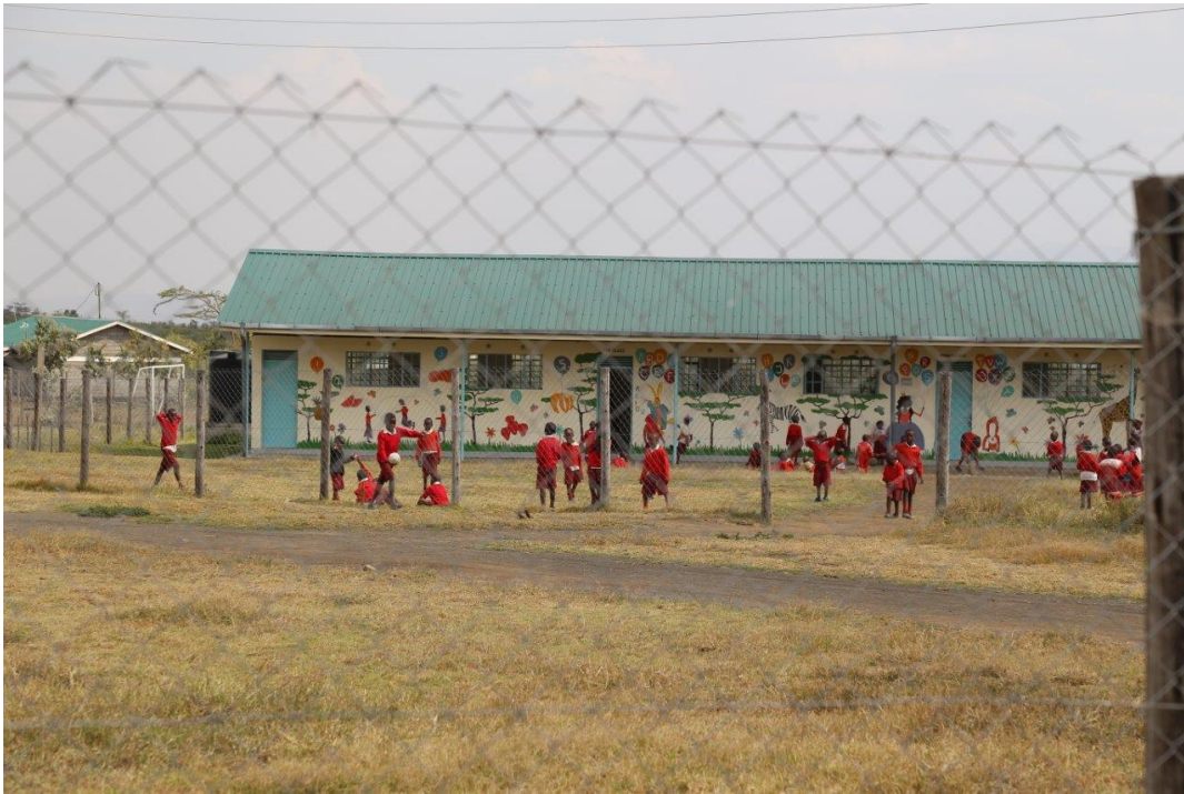
Picture 5. RAPLand Primary School