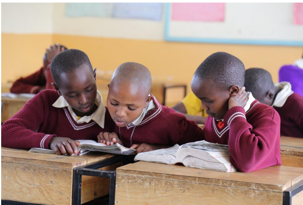
Picture 4. RAPLand Primary School