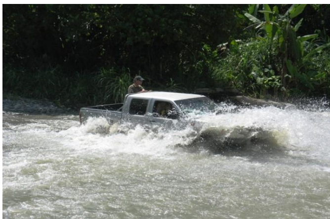
Picture 23: Panel team travelling through a wet crossing between Popondetta-Kokoda National Highway

471. The Panel team travelled widely in both WNB and Oro provinces, experiencing the road conditions first hand. Although it was the dry season, many parts of the major and minor access roads were in a serious state of disrepair and difficult to drive on even in 4 x 4 vehicles. Pictures 21-22 show the difficulties associated with traversing even the national highway between Popondetta and Kokoda in Oro province during the dry season. Bridges that were washed away during Cyclone Guba have not been repaired, and thus vehicles must drive across riverbeds in up to three feet of water. The Panel was told that some of the road works and bridge construction planned under the 1992-2001 Oro Smallholder Oil Palm Development Project were never undertaken. This despite the fact that smallholders planted oil palm at the encouragement of that Project and with the expectation that adequate facilities for FFB collection would be developed. 537 In one instance, the Panel team saw villagers crossing the Mambare River near Butue village on a rubber tube; the Panel was informed that villagers regularly transport their FFB in the same manner on