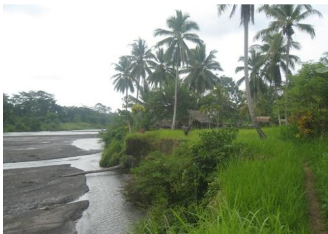
Picture 20: View of Ambogo River in Oro province, alleged to have received palm oil mill effluent