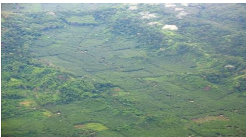
Picture 4: Aerial view of oil palm blocks in West New Britain province