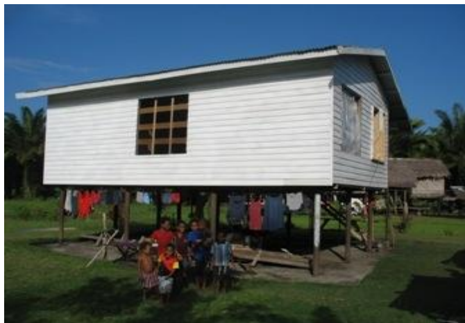
Picture 11: View of an "oil palm" house and more traditional house in WNB province