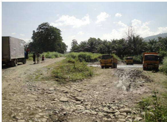
Picture 26: Company Trucks Repairing Sections of Kokoda National Highway

476. The two groups with a strong vested interest in seeing the roads well maintained are the milling companies and the smallholders. The Panel team notes that the milling companies in both West New Britain and Oro are the only organizations carrying out any road maintenance at present. They clearly have a vested interest in ensuring that roads are sufficiently well maintained to transport FFB to the mills. Thus, it does not seem plausible that they would not “ contribute their funds in a timely manner ” 546 to an RMTF as the Requesters suggest. Their milling operation would cease to function effectively if they did not. Indeed, Management was aware beginning as early as 2006 that RMTF “ Cost-sharing with the mills does not seem to be a problem but provincial government is unlikely to be unable to (sic) provide a reliable share and alternative arrangements need to be considered. ” 547