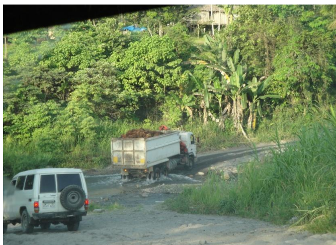
Picture 22: Company Truck collecting FFB along Popondetta-Kokoda National Highway