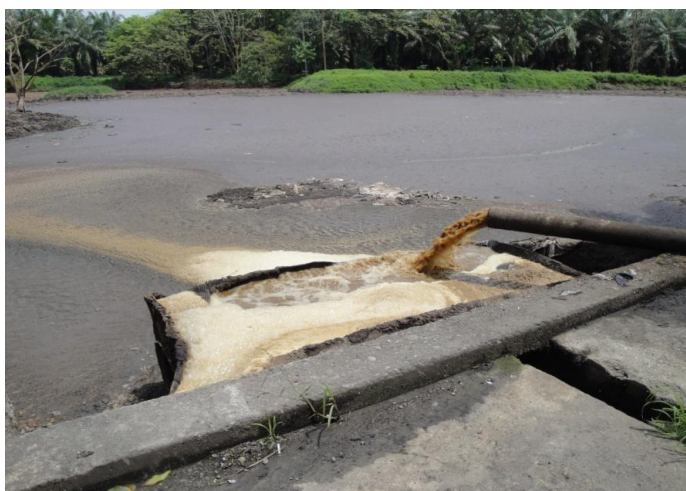
Picture 21: An effluent pond of Kula/Higaturu Oil Palm at the time of Panel team's Investigation visit