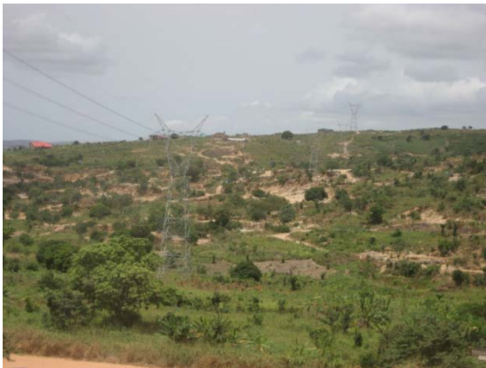
Detail of Transmission Line crossing landfill (TL tower closest to camera is # 449) Picture taken from A(x) looking SW on 4/21/10