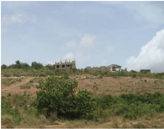
Construction activity near D(x) Picture taken from F(x) on 4/21/10