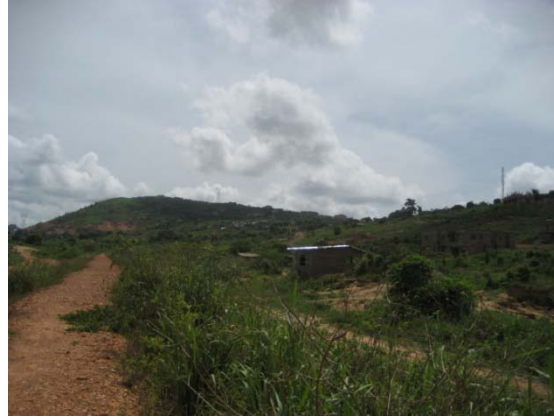
Small building near culvert [E(x)-F(x)] Picture taken from F(x) on 5/9/10