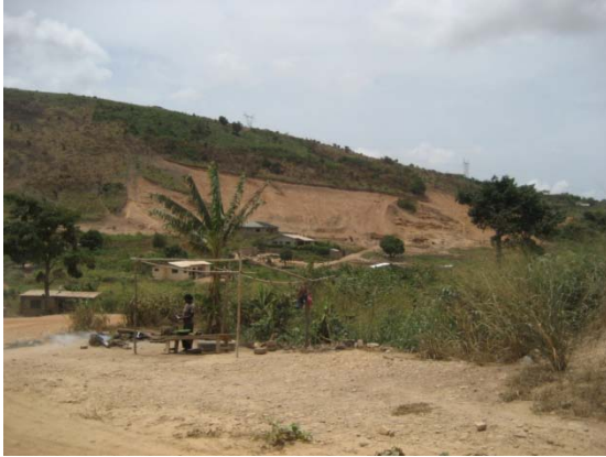
Earth moving activity near B(x) (Note Transmission line in the background) Picture taken from C(x) on 4/21/10