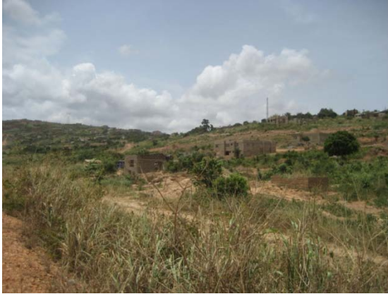
Small building near culvert [E(x)-F(x)] Picture taken from F(x) on 4/21/10