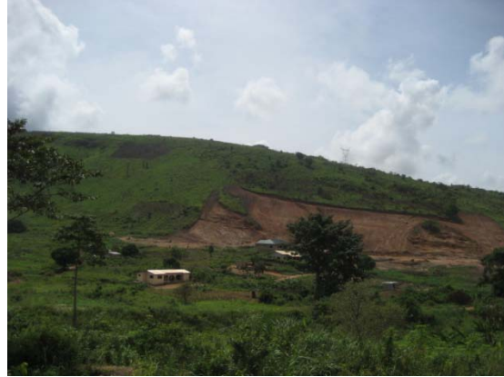
Earth moving activity near B(x) (Note Transmission line in the background) Picture taken from C(x) on 5/9/10