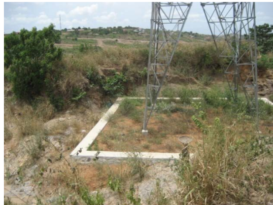
Detail of base of TL tower #448