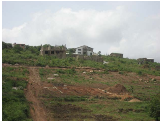
Construction activity near D(x) Picture taken from F(x) on 5/9/10