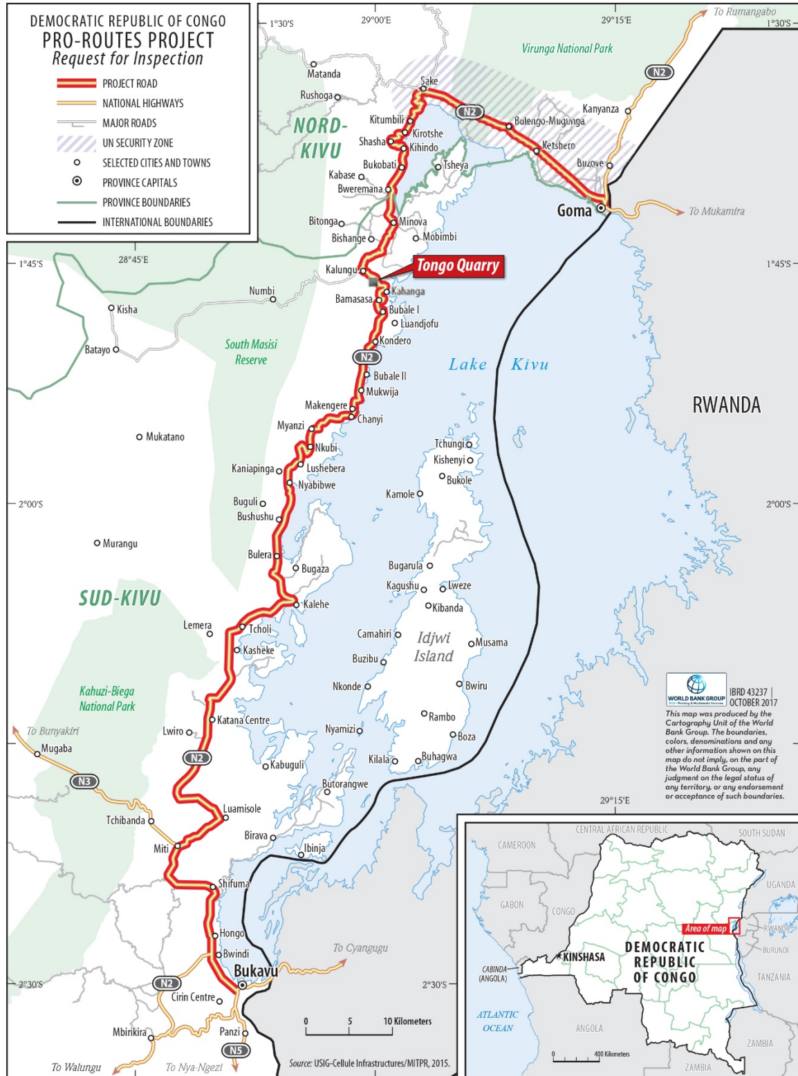
Figure 2. Map of the Bukavu-Goma road segment