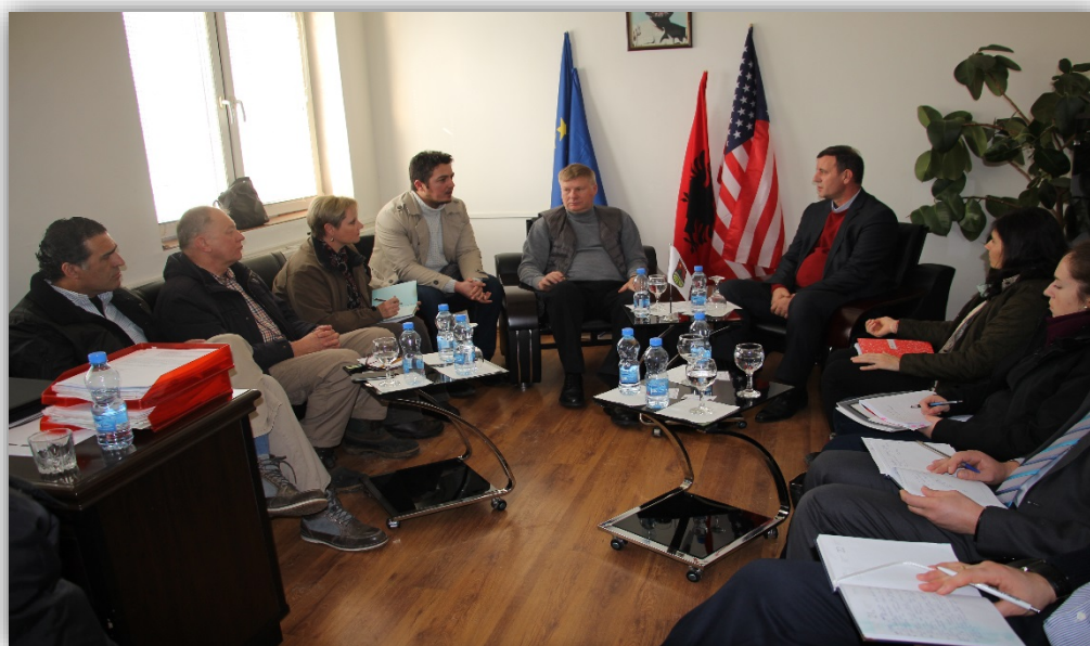
Figure 4: Panel Team meeting with Mayor of Obiliq Municipality

41. The Bank, in cooperation with the European Commission and USAID, was to support the strategy by helping attract private investors for development of the new plant and the Sibovc Field, and by assisting privatization efforts related to Kosovo B and KEK Distribution. MIGA was to provide partial risk guarantees to bidders on the new plant and the Sibovc Field, Kosovo B privatization, and/or KEK Distribution privatization. PRGs offered by IDA for strategy implementation were to amount to US$38 million. IFC was to serve as transaction advisors for KEK Distribution and would coordinate with the Bank and MIGA to attract strategic investors. The Strategy envisioned a new 500 MW plant that – together with the rehabilitation of Kosovo B and the development of full hydropower potential – would by end-2015 replace Kosovo A, imports of about 500 GW from the regional grid, and about 150 MW in small diesel generation backup supply. 33