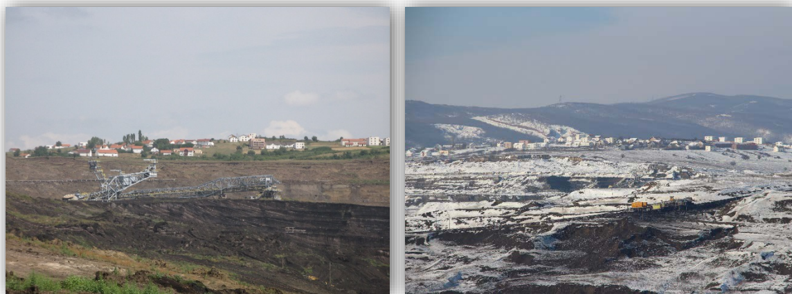
Figure 7: Sibovc South Mine and settlements

157. The Panel recognizes the Response has committed to update the RPF based on identified shortcomings and changed conditions. The Panel expects the proposed, updated RPF will examine resettlement impacts in the context of Zone restrictions.