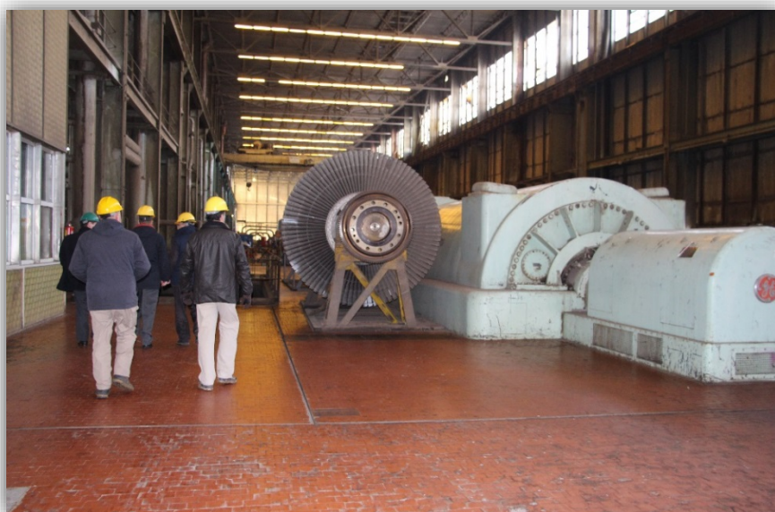
Figure 3: Kosovo B Power Plant

35. The 2006 Interim Strategy Note re-emphasized that energy and mining were key to Kosovo's growth and that there was potential to attract strategic, foreign investors both for export and to satisfy domestic needs. The major constraint was lack of institutional capacity. The Strategy explained consensus had emerged between the donors and the Government on how to promote the responsible development of Kosovo's energy sector. The future of the sector rested on private sector involvement and required policies and a regulatory framework; assistance was needed to attract qualified, strategic investors; energy bill collections had to be improved and non-technical losses reduced, and near-term donor support was necessary to ensure continued operation of existing plants. 28