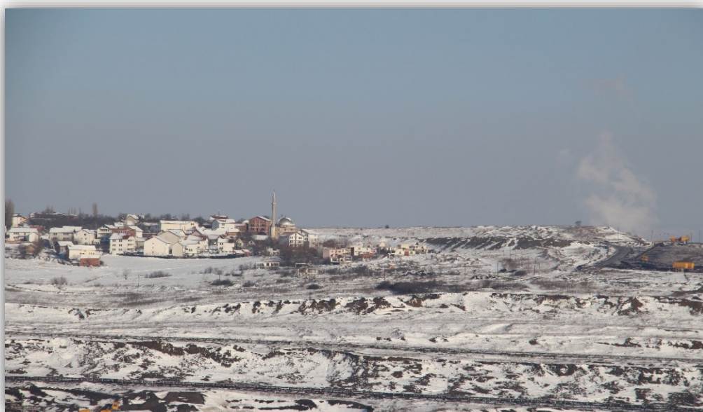
Figure 10: Sibovc South Mine and Hade village

185. Monitoring and Supervision of the Shala Resettlement. Monitoring and evaluation and Bank supervision are keys to assessing whether a resettlement project is implemented successfully and what corrective measures may be required to deal with implementation challenges. They are also crucial for establishing whether a RAP has achieved its objectives. The CLRP-SAF, approved in May 2013, added a component to the Project giving the Bank responsibility for monitoring the Shala RAP implementation. A resettlement consulting firm was hired which produced two monitoring reports, one in April 2014 and another in September 2014, and prepared a Final Completion Report for the Shala resettlement in July 2016.