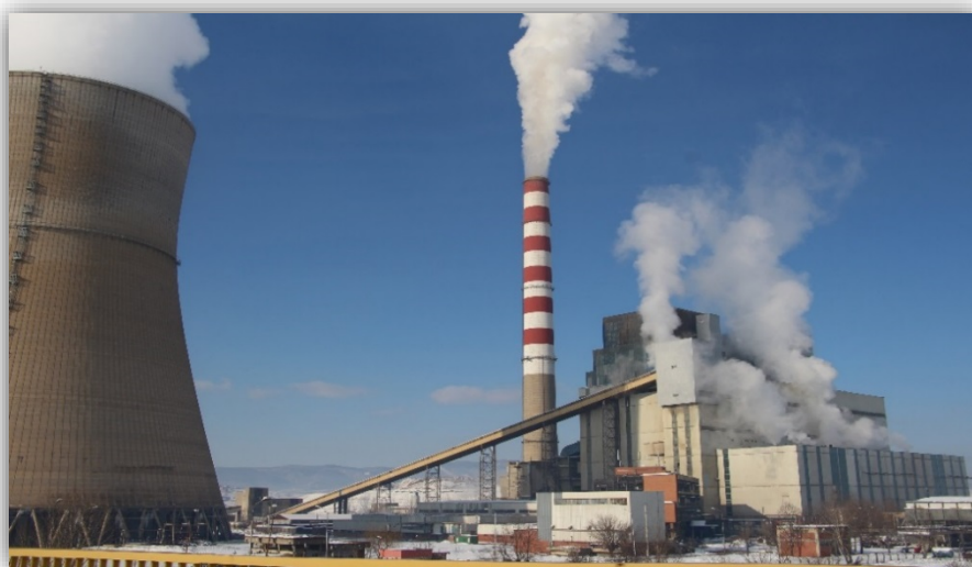
Figure 2: Kosovo B Power Plant

25. The energy sector has been a central pillar of Bank engagement in Kosovo since the end of the conflict in 1999. During this period the Bank established itself as a leading energy sector advisor to a succession of Kosovo governments. Actors such as USAID, the European Union, and several national entities have worked alongside the Bank on energy in Kosovo, focusing on different aspects. 18 The Bank's role evolved over time, from conducting a stocktaking exercise of the energy sector in the immediate post-conflict years, to developing a framework for private sector investment, to various capacity development initiatives, and ultimately to financing the ESIA for the proposed KPP and considering support for the new power plant through a Partial Risk Guarantee (PRG). A more detailed description of the Bank's involvement in Kosovo's energy sector over the years is provided below. 19