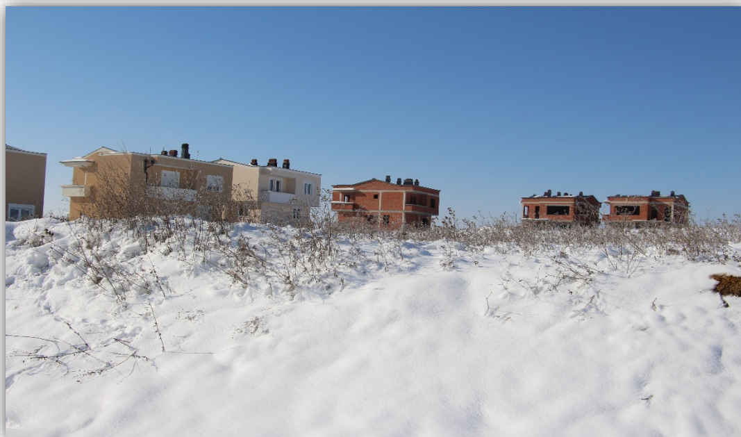
Figure 9: Houses at New Shkabaj resettlement site

177. Temporary Resettlement. The Panel notes that temporary resettlement is not recommended in any resettlement situation except disaster relief. This may have been the case for the 2004/05 emergency evacuation (which is not linked to the Bank) and partially in the Shala resettlement, as 21 households were asked by KEK to relocate in January 2012 due to safety concerns. 185 However, the possibility of temporary resettlement was anticipated in the Shala RAP preparation process, since such discussions were held with community members for more than a year. This process included interviews with individual households about what arrangements they would prefer should temporary resettlement be required. 186 See the supervision section of this chapter (below) for further discussion of temporary resettlement, particularly issues with the payment of rental allowances.