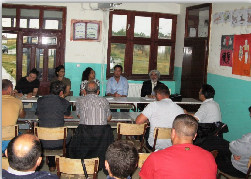
Figure 1: Panel Team meeting affected people in Hade

8. The Request includes as an Annex a 2014 report titled “ Does the Kosovo Power Project’s proposed Forced Displacement of Kosovars comply with International Involuntary Resettlement Standards? ” written by involuntary resettlement expert Professor Theodore Downing 6 . This Annex argues that households are being forcefully displaced through a strategy of incremental expansion, which the author calls The Stepwise Mining Expansion and Land Take (or SMELT) Strategy . It says this strategy slowly “amputates” parts of settlements, a few houses or a neighborhood at a time. It moves mining operations near settlements, sometimes within a few hundred meters. It claims such a strategy favors mining interests over development by spreading investment costs for land acquisition throughout the lifespan of the mining field, and allows the mining company to justify forced displacement in the interest of public safety and health, “a resolution to a problem that the mine created in the first place.”