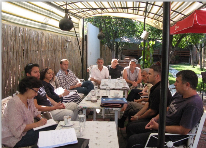
Figure 5: Panel Team in a meeting with representatives of emergency evacuation households

105. The Request refers to the evacuation of certain households from Shala neighborhood as "forced displacement" as a result of the Bank's non-compliance with its policies. It is signed by an individual identified as the "Head of Community" who was evicted in 2004 from this neighborhood and imprisoned in 2004 for refusing to leave while his and other houses were demolished by authorities. In meetings with the Panel team in Obiliq, this individual and others who had been forcibly evicted complained about the resettlement process, the inadequacy of the transitional assistance, and their inability to restore their livelihoods after the evacuation. They told the Panel that prior to the evacuation their livelihoods included cattle raising and farming.