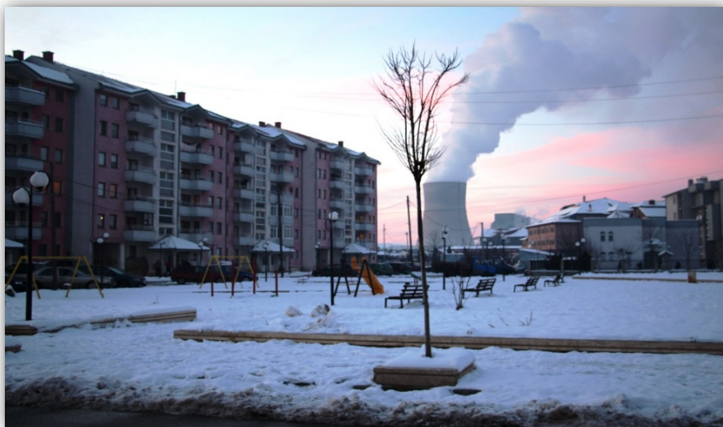
Figure 6: Apartment building (left) in Obiliq where resettled families were provided temporary housing since 2004-05

percent refused compensation and went to court for issues related to termination of the transitional allowances in 2012. Out of 98 families who applied for a plot at New Shkabaj, 77 received titles to their new land, while the others decided not to apply since they contested the Government's decision to terminate rental allowance. 127