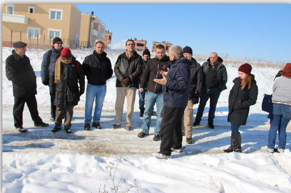
Figure 8: Panel Team and Requesters at New Shkabaj resettlement site

174. During its field visit the Panel observed ambiguity regarding institutional responsibility and division of roles among the MESP, KEK, and the Obiliq Municipality for addressing different aspects of resettlement implementation, which likely contributed to the delays in preparing basic infrastructure at the resettlement site. The Panel also notes the RAP does not assess the resettlement capacity and experience of the implementing agency. At the same time the Panel recognizes certain capacity development activities were supported by the Bank, such as the workshops mentioned in Chapter 5 above.