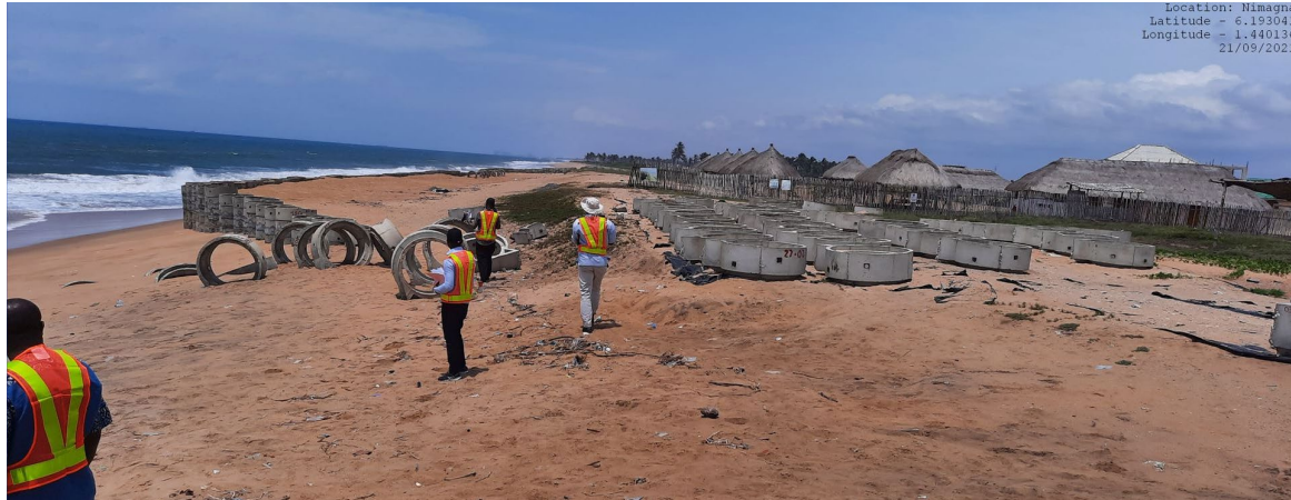
Picture 6. Emergency coastal works to protect livelihood assets (a small resort) is almost completed. Surplus construction material will be removed (September 21, 2021)