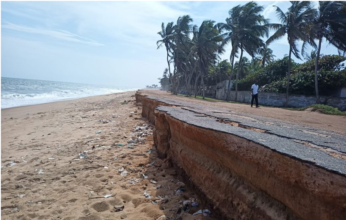
Picture 2. Remnants of the eroded Lomé-Aného road