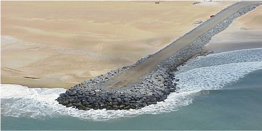
Picture 3. Example of a groyne that prevents coastal erosion (not in Togo)

10. For the reasons above, the World Bank committed at COP21 to support Togo and other coastal countries in coastal zone management. The Bank is using its convening power, instruments, finance, and partnerships as part of the 10-year West Africa Coastal Areas Program (WACA) 2 to assist countries in managing coastal erosion, flooding, and pollution.