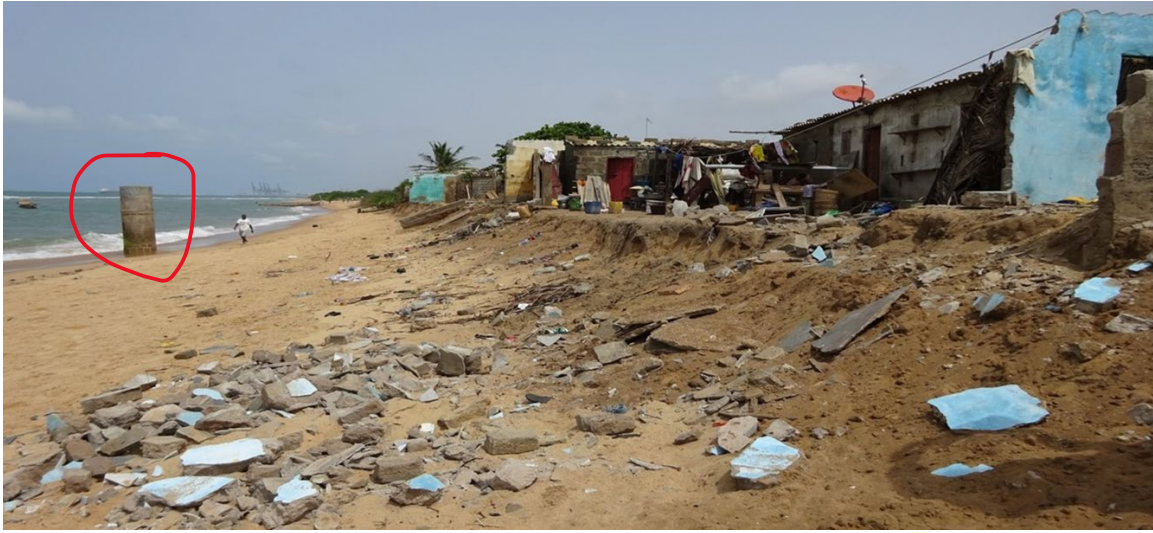
Picture 1. Coastal erosion in Togo; the structure on the far left used to be a water well