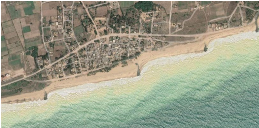
Picture 5. Groynes at Kpeme on the Togolese coast to be rehabilitated by the Project (2021)

41. The Project will not have permanent adverse impacts on artisanal fishing activities. Project-financed civil works (groynes, breakwaters, beach replenishment) are not intended to limit access to the shore or fisheries. Rather, the Project will result in an increased beach width of around 30 m (instead of the currently expected loss from erosion of 40 m over the next 15 years). The Project aims to strengthen the resilience of targeted communities and areas in coastal Western Africa. It is financing coastal protection to prevent erosion in Togo. This will help to secure the beach, provide greater access to fishing activities, and protect an estimated 4,600 households from the impacts of coastal erosion. Any potential temporary access restrictions resulting from the construction works will be assessed and compensated, as may be warranted.