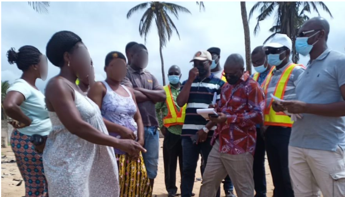
Picture 4. Mission team meets with Dévikinme community representatives (September 21, 2021)

33. A Bank team visited the Project area in Togo during September 20–22, 2021. The mission team inspected the six sites for emergency protection ( Gbodjomé , two sites in Dévikinme , Tango , Nimanga , and Adissem ), the seven sites for construction of new groynes, and the six sites for rehabilitation of existing groynes. The Bank team met with about 62 community members in the concerned villages, as well as the PIU and the contractor building the emergency works.