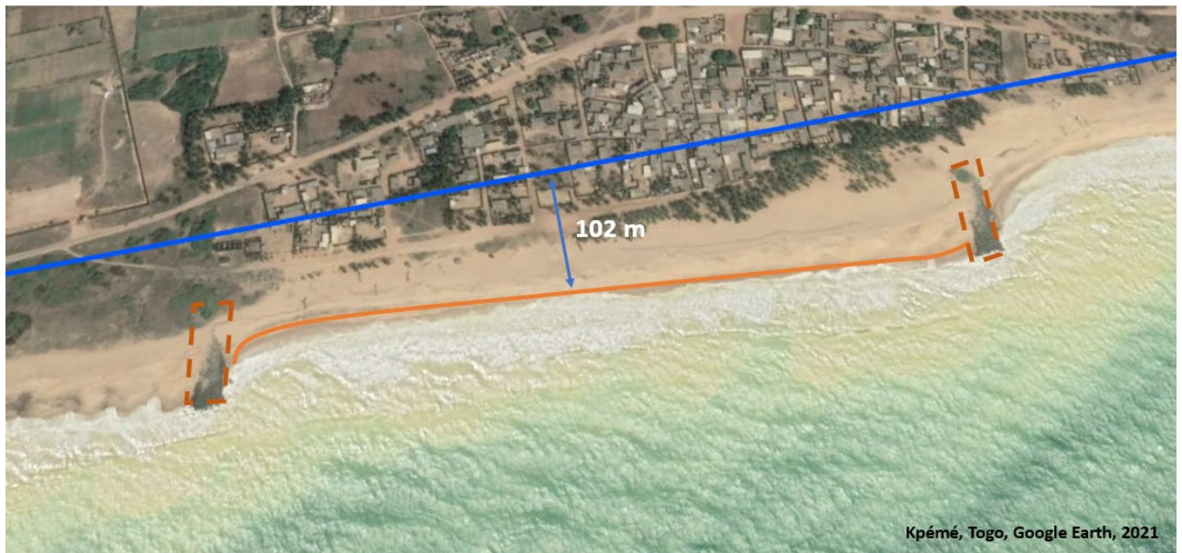
Picture 7. Gain in sand area resulting from groyne construction

54. It is important to note that the beach-replenishment-only option, as suggested in the Request, is not viable based on scientific and technical studies. Without the additional groynes on the shoreline to slow or block the sediment flow, the replenished sand would quickly vanish again. Hence, the no-groyne option would not protect coastal communities from continued erosion and last just about three years, at which point the costly sand supply would need to be repeated.