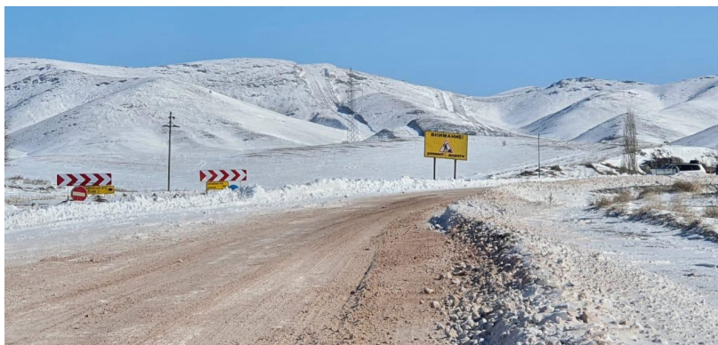
Photo 14: Entry from the four-lane completed section to two-lane Village Road