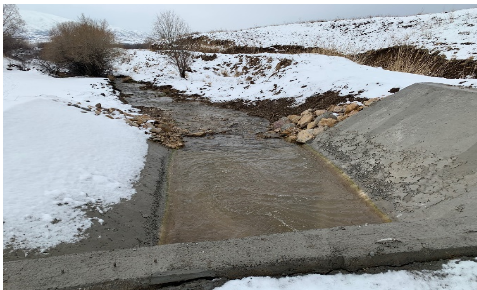
Photo 9: Irrigation canal control point feeding to Shakpak Baba village

38. During May-June 2020, the local water authority carried out major repair works on this system, which led to a temporary suspension in supply of irrigation water to the village. The repair works included mechanical clean-up, installation of hydraulic facilities (4 locks regulating water level alongside the irrigation canal). However, this year the water will be supplied as usual once the season starts. The repair works were not a part of the Project.