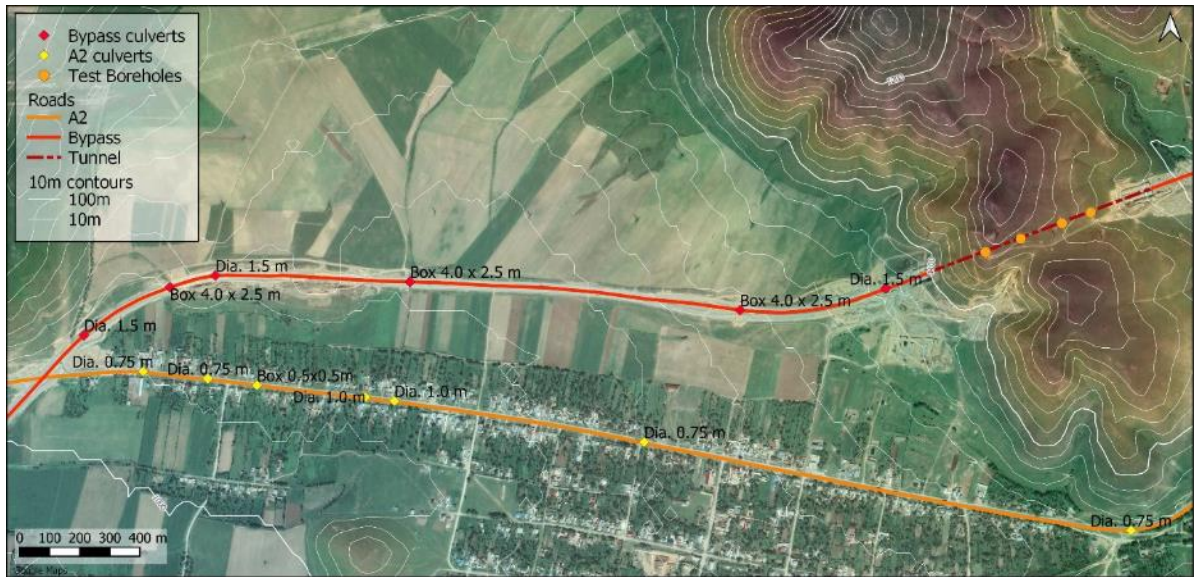
Figure A1: The Village Road and new Bypass Road culvert locations in Shakpak Baba Village