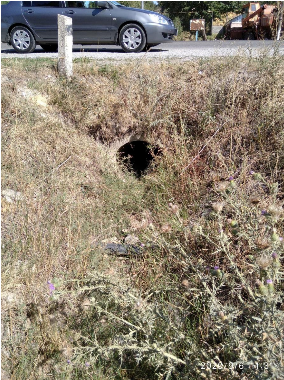
Photo provided by the Requesters' Representative showing the allegedly clogged culvert on the Village Road