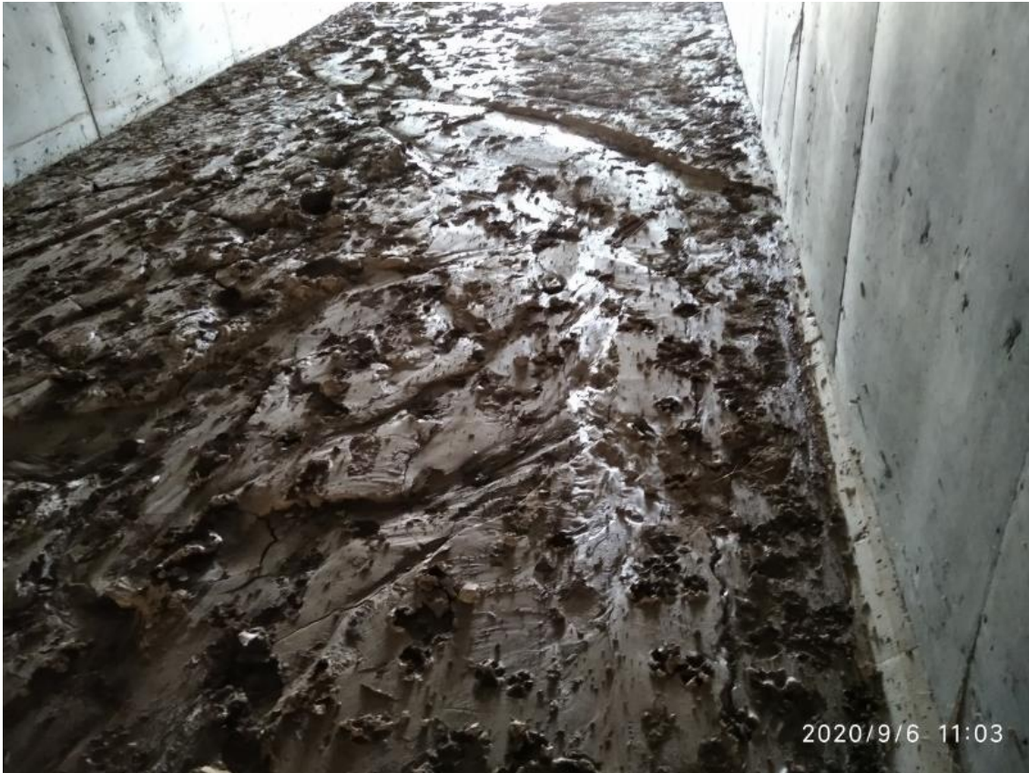
Photo provided by the Requesters' Representative showing the floor of the allegedly clogged culvert / cattle underpass on the new Bypass Road