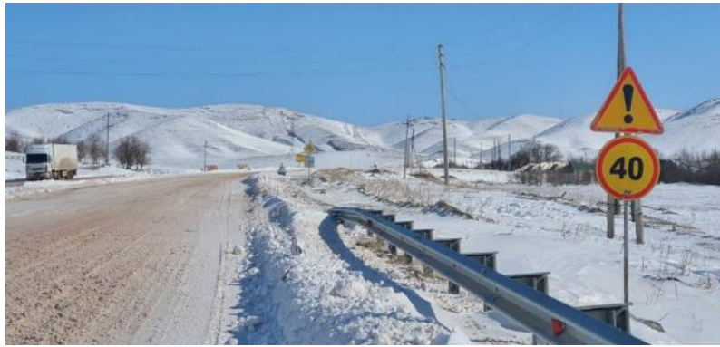
Photo 12: Speed reduction signs at entry from the four-lane completed section to two-lane Village Road

47. Traffic Management. The Contractor has a Traffic Management Plan (TMP) in place. 15 In Management's view, the Contractor has taken necessary measures to ensure proper traffic safety management in relation to Project construction, including the junctions between the new Bypass Road and the Village Road. The Project engineer and the local police regularly monitor these measures. Road signs, barriers, road markings and signal posts are updated and replaced as necessary.