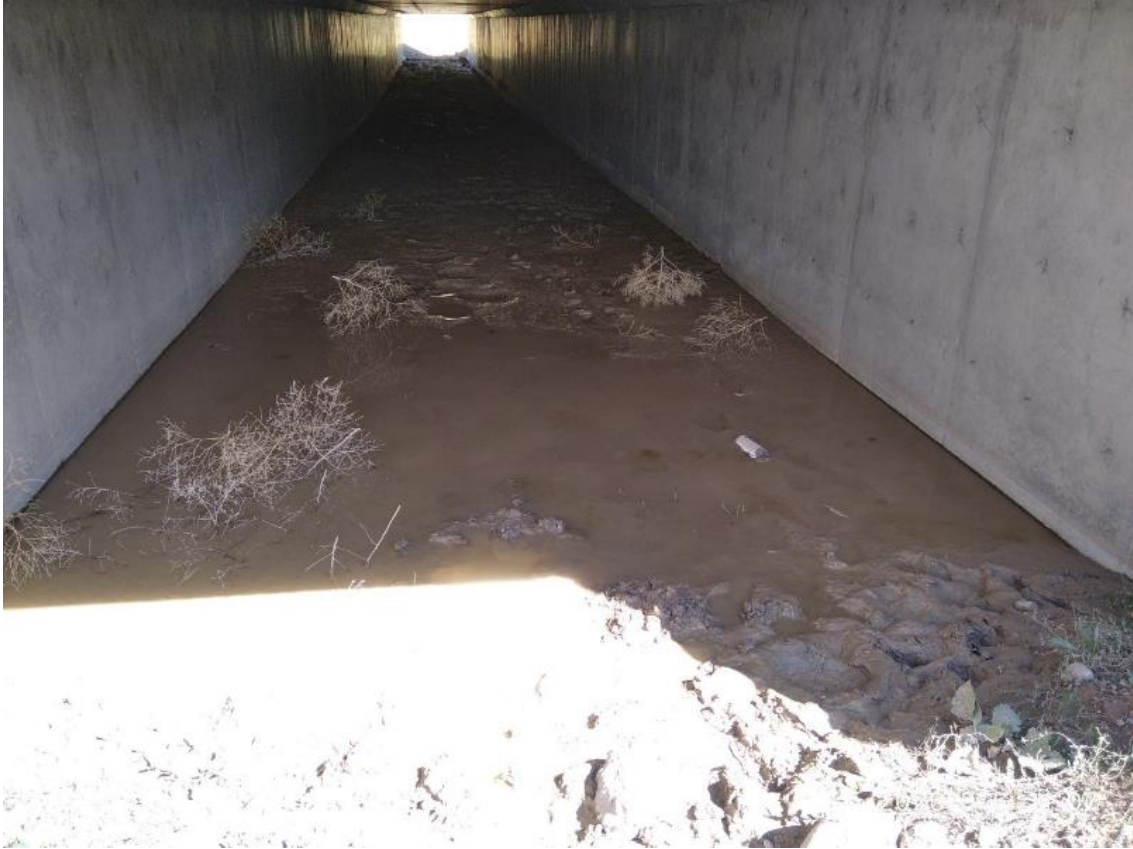
showing the floor of the allegedly clogged culvert / cattle underpass on the new Bypass Road