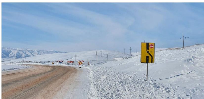
Photo 15: Exit from the two-lane Village Road to the four-lane completed section

48. Traffic Volumes: There is equally no indication or evidence that the traffic volume has increased as a result of the completion of the upgraded road sections before and after Shakpak Baba village. This road is and was the only road connection available for traffic between Almaty and Shymkent. There is no alternative east-west road connection at least 200 kms around Shakpak Baba from which traffic could be drawn or re-routed to the upgraded Project road, and which otherwise would not have passed through Shakpak Baba.