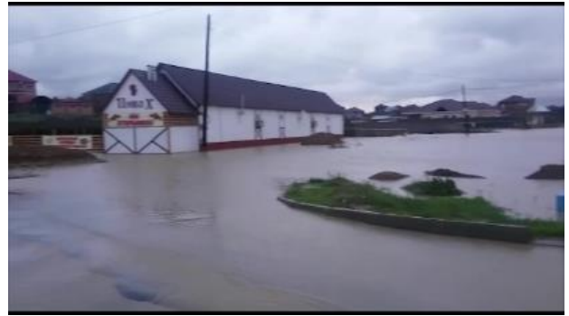
Photos 3 - 6: April 2017 Flooding impacts in the Turkestan region (photos do not include Shakpak Baba Village)

28. At the request of the Committee for Roads, the Contractor had cleaned the culvert in March 2017 before the flood occurred. The photographs of the culvert shared by the Requesters' Representative in his complaint letter of September 30, 2020, also do not show that the culvert was clogged (see Annex 4) and do not match the situation in 2017.