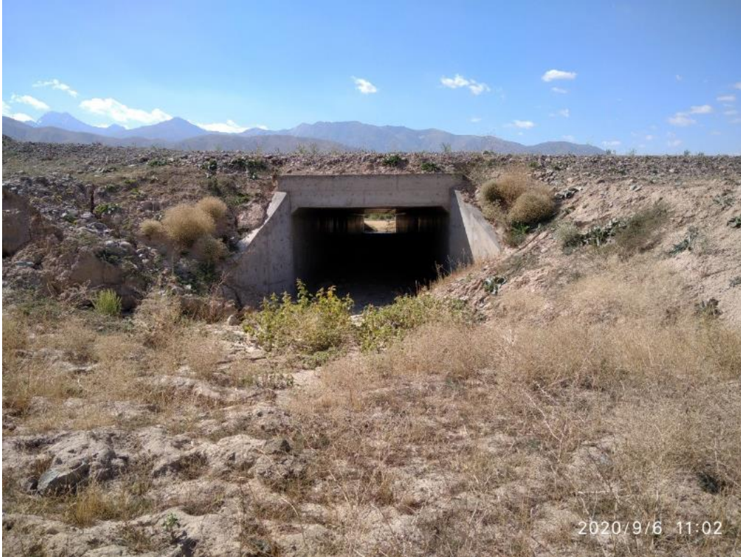
Photo provided by the Requesters' Representative showing the allegedly clogged culvert / cattle underpass on the new Bypass Road