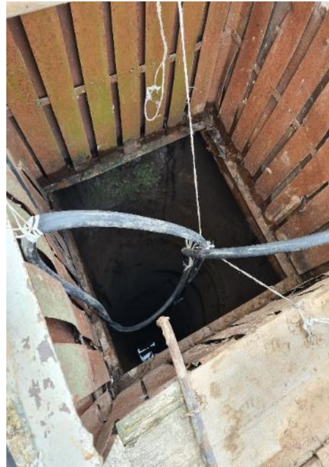
Photos 7-8: Wells on two different properties that were flooded in 2017

36. Availability of Spring Water: The Request erroneously claims that Project works have had an impact on the availability of spring water used by residents to water their gardens. Management confirmed with the local water authority that there are no groundwater springs on the northern side of the valley (where the Bypass Road runs) that are used by the village. The only spring used by the village is sourced from the other side of the valley and feeds into one of the village's two irrigation canals. Therefore, there is no impact from the road or tunnel construction on groundwater springs used by the village.