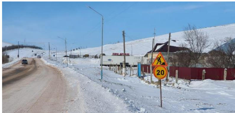
Photo 13: Speed reduction signs at entry at the junction approach before exit to the village